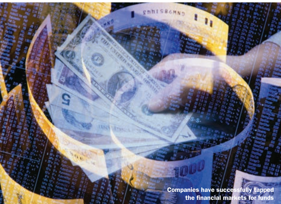
Companies have successfully tapped the financial markets for funds